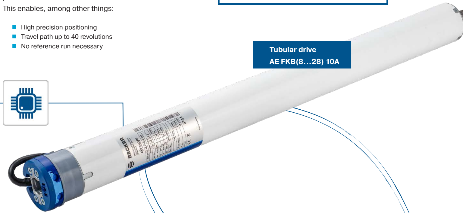
Tubular drive AE FKB(8...28) 10A