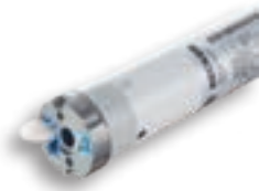
Roller shutter drive with electronic limit switching

It reacts on contact with an obstacle and causes the roller shutter to stop. Whether flower box or tricycle - everything is safe, completely without your intervention. The matching control system additionally increases the comfort: Opening and closing happens fully automatically and around the clock.