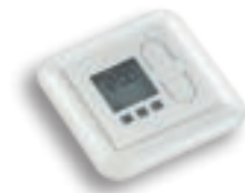
TimeControl U26 Timer