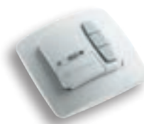
MemoControl MC42 Memory button